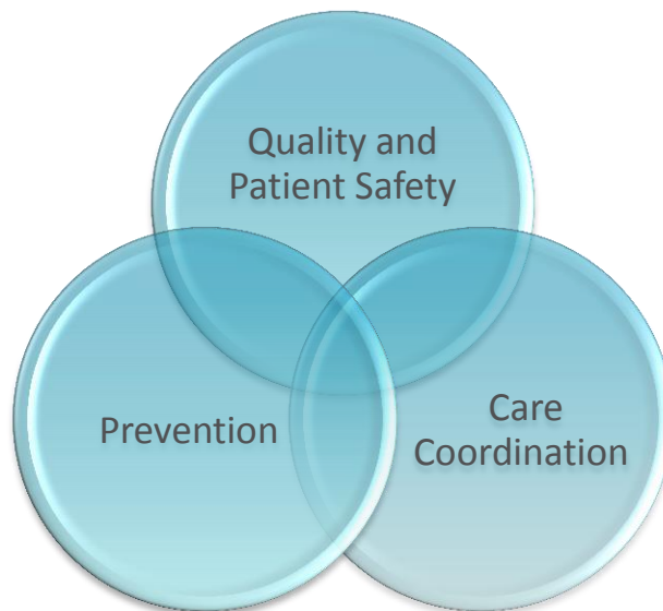
Figure 2. Mechanisms to Improve Population Health

Managing Population Health: The Role of the Hospital. Health Research & Educational Trust, Chicago: April 2012.